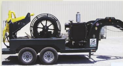
XK-90 (90 Ton) and XK-150 (150 Ton)

Professional Wireline Rentals is on call 24 hours a day and with their own transport will deliver on time to your site.