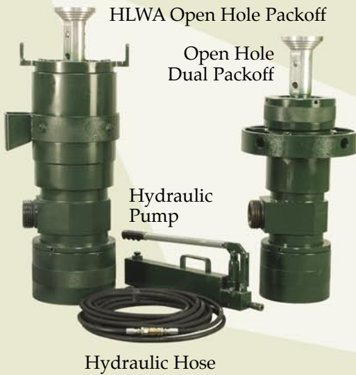
HLWA Open Hole Packoff