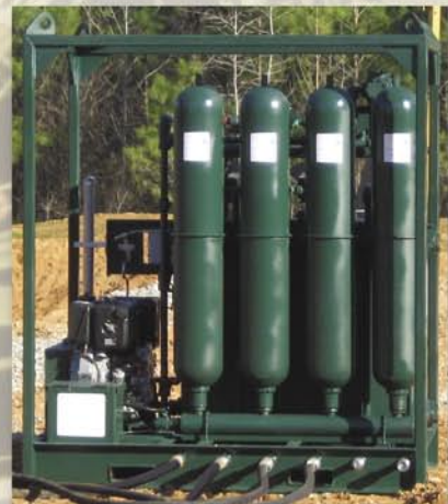
3-4 Bank Accumulator With 1" Hoses

Frac valves available in 4 1/16" - 7 1/16" bores in working pressure of 5,000, 10,000, and 15,000 psi.