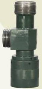
10,000 PSI Integral Pump In Sub

15,000 PSI Air Operated Grease Injection Unit