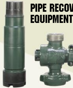
Tubing/Drill Pipe Crossover to 4-3/4" - 4 thread half