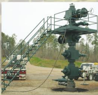
7 1/16" 15K Hydraulic Frac Stack