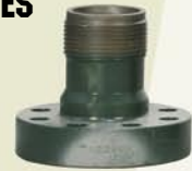
Wellhead Flange To Thread Half