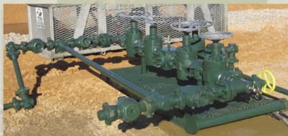
2 1/16" 10K Manual Manifold