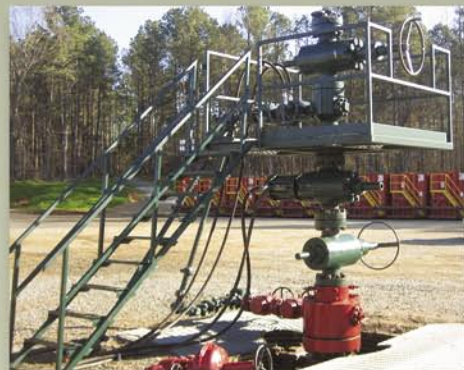
4 1/16" 15K Hydraulic Frac Stack