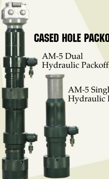
AM-5 Dual Hydraulic Packoff