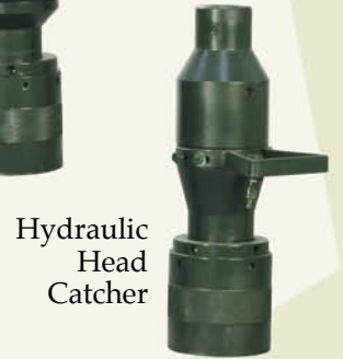
Hydraulic Head Catcher