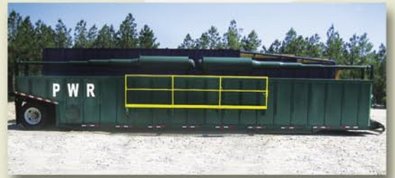
FLOW BACK TANK 300 BBL Gas Buster