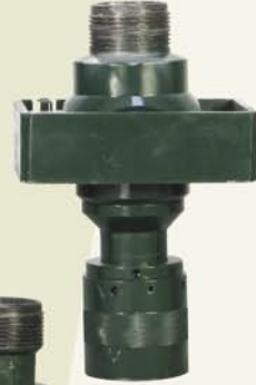
Hydraulic Tool Trap

15,000 PSI Air Operated Grease Injection Unit